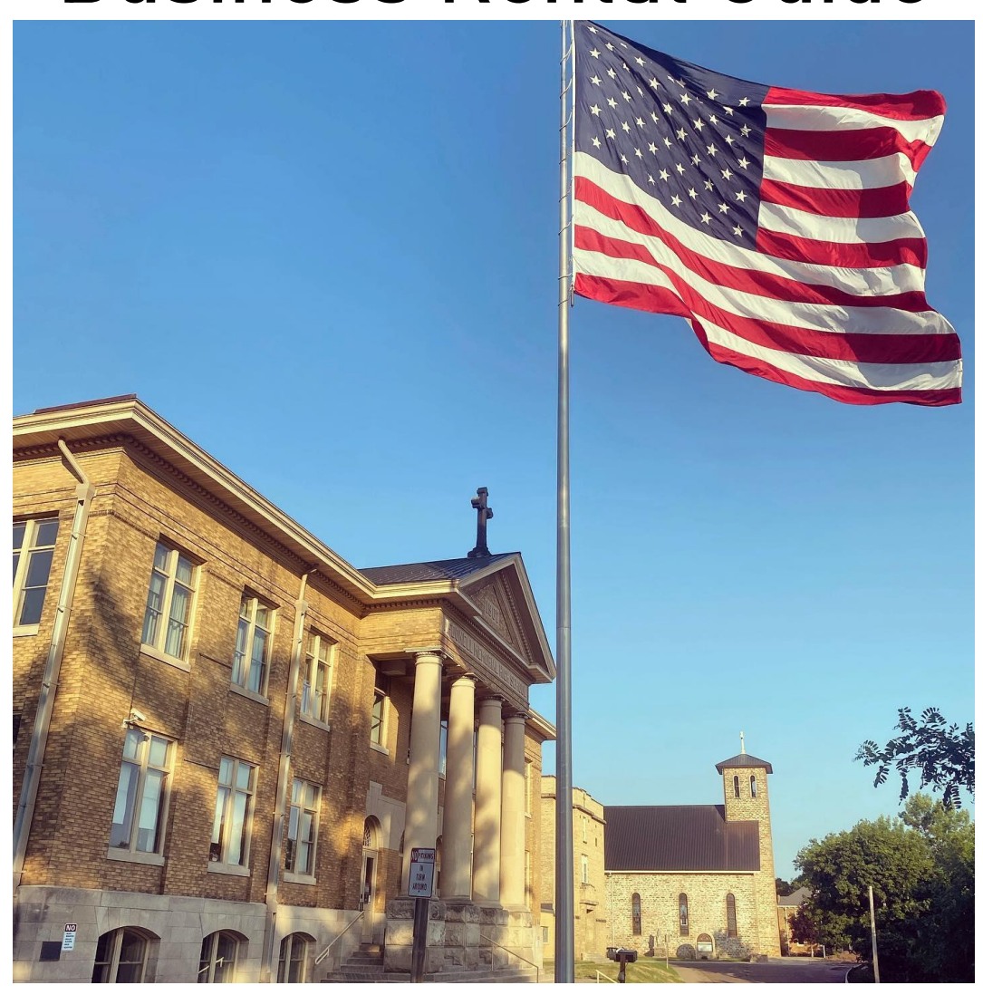
Chippewa Valley Cultural Association, Inc. Heyde Center for the Arts 3 S. High Street Chippewa Falls, WI 54729