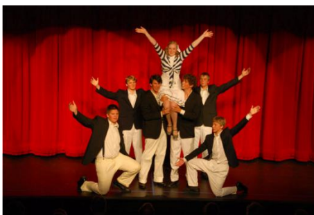
Community theater offers a chance for everyone to be an actor! Last year the youngest actor was 6 and the oldest was over 70 years young!

Collaborations with individuals and groups have helped provide support to a number of community development activities. For example, the CVCA helped raised funds for the UWEC Emergency Fund for non-traditional women students, Harmony House (homeless families shelter), and the Chippewa Falls Music Association. The Center housed other community events along with partners such as Chippewa Valley Community Chorus, River Source Family Center, the Chippewa Falls Public Library, Valley Vineyard Church, St. Joseph’s and Sacred Heart Hospitals, Chippewa Falls Senior High School, and the Chippewa Area Chamber of Commerce.