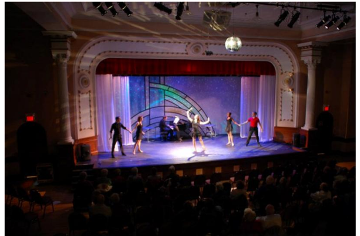
No need to travel to the Twin Cities, Madison or Chicago to see professional traveling musicals like the ' S Wonderful .'

Well over 100 artists exhibited their work at the Spring Art Show in April 2010, many for the first time . The Center is gaining a solid reputation for its gallery space so there are more requests from area artists requesting to be part of the “artist of the month” series. The Center has used both the Schafer and the Casper rooms on the main floor, but this past year it has opened up the Volunteer and Rotary Rooms (third floor) for additional artists. These rooms have allowed for a more creative combination of artists, i.e., mixing styles, mediums, ages, and experiences. The Heyde Center collaborates with a number of area arts organizations that feature a large number of artists’ work (e.g., Hugh Mandelert Art Society, Valley Art Association, Beaver Creek Photography Club, Eau Claire Area Art League) and has hosted two exhibits of work from high school students from around the area. The Center displayed the traveling exhibit from VSA Arts Wisconsin, dedicated to providing arts and educational opportunities for people with disabilities and increasing access to the arts for all.